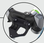
Quick release design: Switch from automated to handheld mode