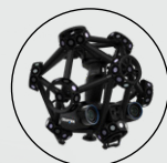
Also available for the MetraSCAN 3D